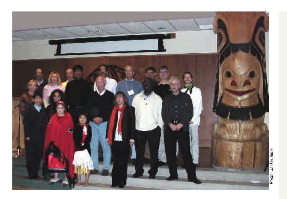
Participants at Marine and Coastal Cross-cut meeting, Vancouver, BC, Canada

waters, Drylands and desertification, and a slightly more specialized cross-cut on the Drivers of ecosystem change. A series of meetings has been established to address these thematic issues, incorporating a cross-cutting, multi-faceted and creative approach to ensuring these issues are adequately represented and key stakeholders and user needs are addressed.