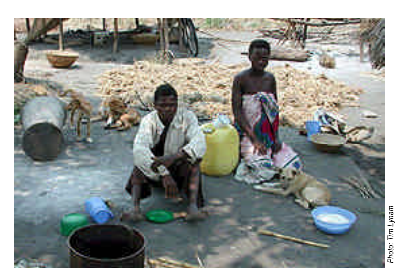
Sorghum, fish, reeds, baskets, thatching grass, fibre, poles, and firewood. This rural scene highlights the importance of natural resources to household well-being in Southern Africa.

on processes at sub-global levels or on interactions across scales. Designed as a multi-scale assessment, the MA includes a global assessment – conducted through the Conditions and Trends, Scenarios, and Responses working groups – as well as sub-global assessments at regional, sub-regional and local scales. In 2005, the MA Sub-Global Assessment working group will publish an Assessment Report drawing on the experiences of the sub-global assessments that will provide a careful analysis of how integrated assessment methodologies being used at the global scale can be adapted and applied to community, national and other assessments.